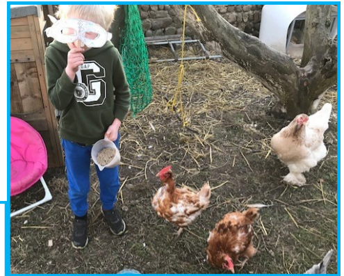
Nico helped to feed the chickens.